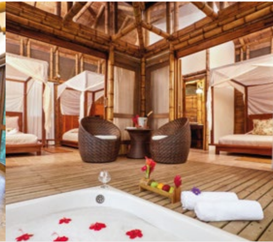
FAMILY STATEROOM 56 m2 / 602 ft2