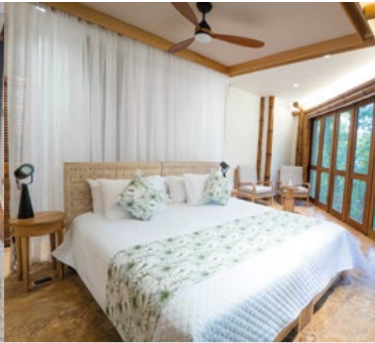
SUPERIOR STATEROOM 37 m2 / 398 ft2