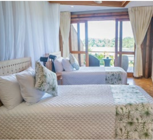
SCENIC STATEROOM 25 m2 / 269 ft2